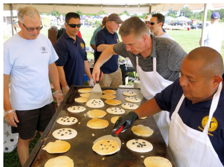
Hundreds of hungry visitors enjoy the Kiwanis Pancake Breakfast each year.