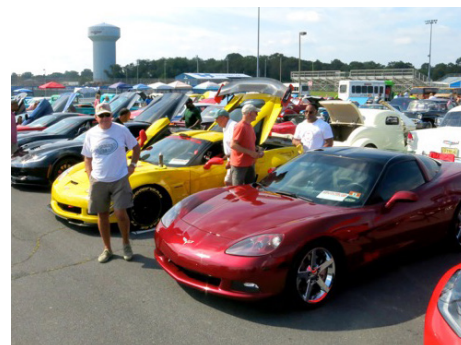
The Cruisin' Classics Car Show, with hundreds of vehicles on display, is always a fan favorite.